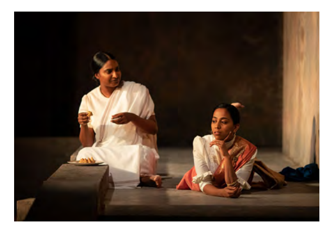
Act 1: Sc 4