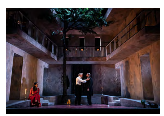
Act 3: Sc 2