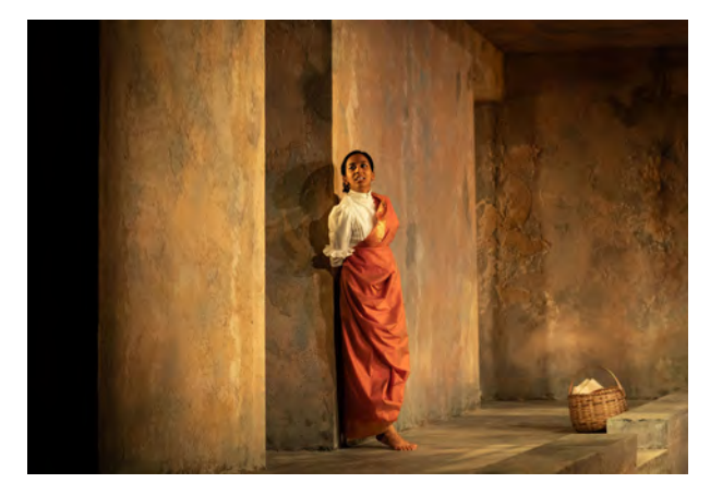
Act 1: Sc 1