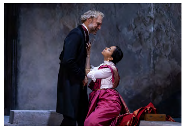
Act 2: Sc 2