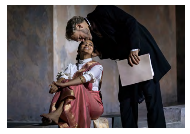
Act 1: Sc 1