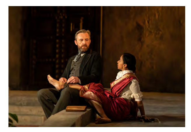
Act 2: Sc 2