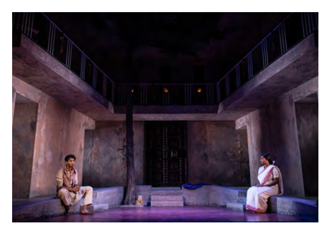
Act 3: Sc 1