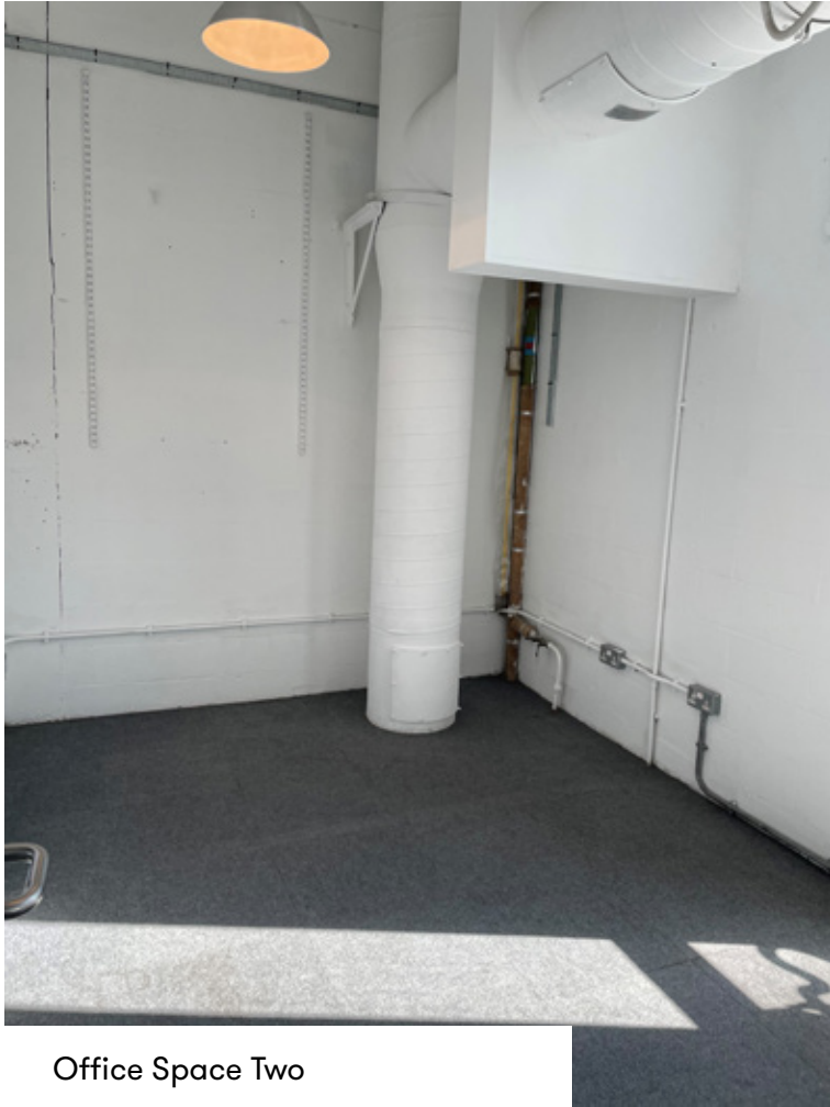
Office Space Two