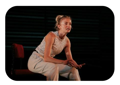
Iphigenia in Splott

We are the Lyric Hammersmith Theatre. We are the civic and creative heart of West London. We believe that everyone deserves to experience the life changing impact of theatre.