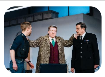
Accidental Death of An Anarchist