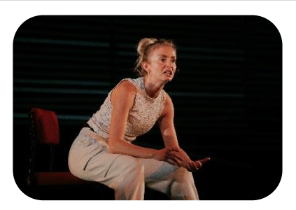
Iphigenia in Splott

We are the Lyric Hammersmith Theatre. We are the civic and creative heart of West London. We believe that everyone deserves to experience the life changing impact of theatre.